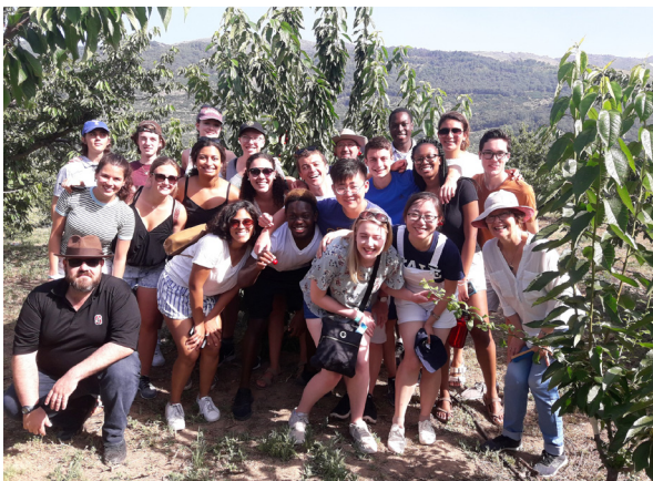
SIHS 2018 Valle del Jerte's Cherry Harvest