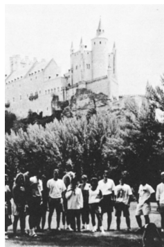
SIHS 1992, Segovia

In 2010, at the suggestion of our Advisory Board and of the institutions that regularly send students to SIHS, we successfully started an additional 3-week internship program for students with superior command of the Spanish language at the end of SIHS, as an opportunity to practice what they have learned and to experience on their own Spanish labor and/or culture in a variety of fields.