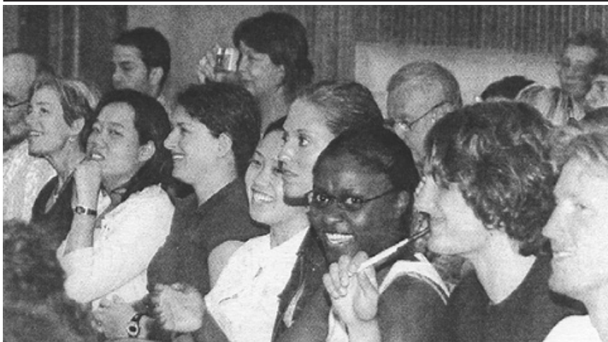
El acto inaugural de los cursos de español para extranjeros tuvo lugar ayer en el Paraninfo de la ULE/ SECUNDINO PEREZ

EL MUNDO / LA CRONICA DE LEON, MARTES 6 DE JULIO DE 2004