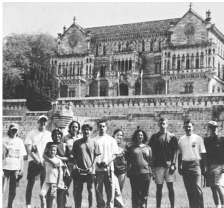
SIHS 1996, in Comillas

The Summer Institute of Hispanic Studies issues detailed pre-departure bulletins for acceptance regarding necessary health and accident insurance coverage, passports, housing in León, travel, medical facilities, etc.