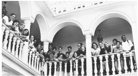
SIHS 1998, Córdoba