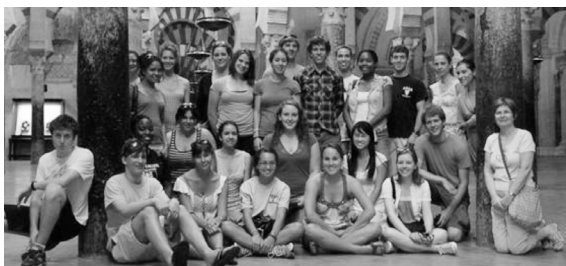
SIHS 2009, Cordoba's Great Mosque (Andalucía)