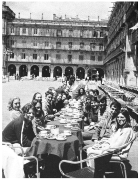
SIHS 1997, Salamanca