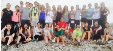
SIHS 2015, Snow in July?