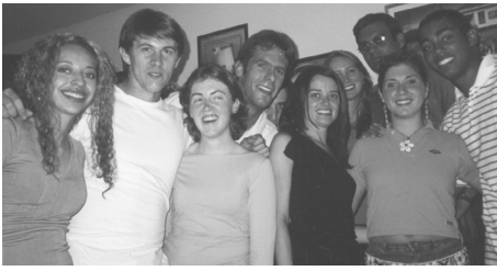
SIHS 2002 on a weekend field trip.