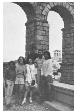
SIHS 1993, Segovia