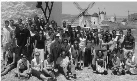
SIHS 2006, La Mancha (Consuegra)

Español 411: Práctica cultural/laboral en España. An opportunity to continue SIHS academic, linguistic and cultural study in an individual practical experience, be it as the continuation of a course (i.e. the Intercultural Way, with the completion of the 700 Kms. by foot of the Camino de Santiago), be it joining the work force (normally