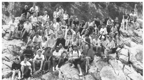
SIHS 1999, Picos de Europa