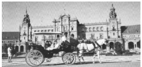
SIHS 2001, in Seville during Orientation