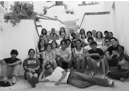
SIHS 2005, Andalusian White Village of Frigiliana