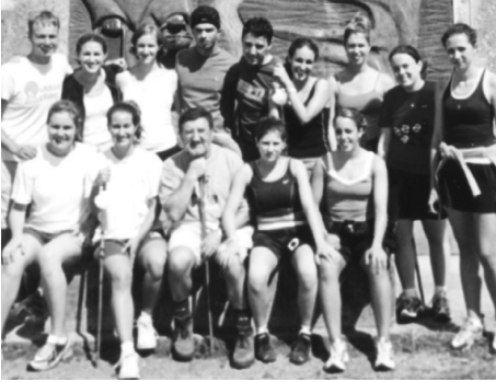
SIHS 2003, Santiago and disciples arriving at Santiago de Compostela on Walking Pilgrimage