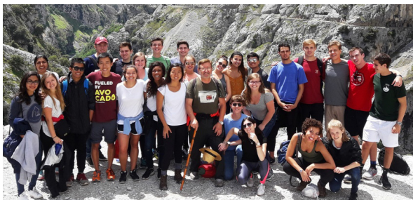
SIHS 2017, Picos de Europa study trip