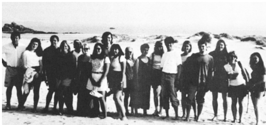
SIHS 1995, Galicia

ation package: (1) a primary application form, (2) a letter of recommendation, (3) a transcript of academic record, (4) a written statement of the reasons for applying to the SIHS, and (5) an application fee of $45 (check made out to “Summer Institute of Hispanic Studies”). The SIHS maintains a system of rolling admissions and, therefore, priority is given to qualified early applicants . To encourage interested students to apply early, the SIHS has two admission periods: