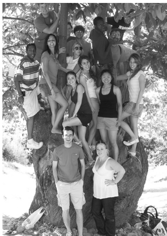
SIHS 2008, Roman Gold Mines of Las Médulas