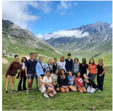
SIHS 2023