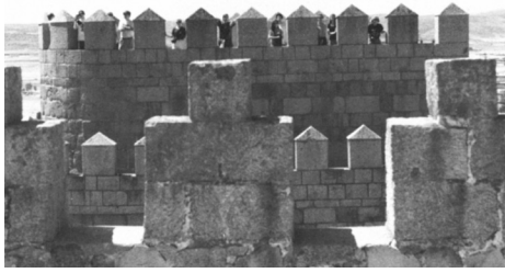
1994 Group at the Walls of Avila

ation package: (1) a primary application form, (2) a letter of recommendation, (3) a transcript of academic record, (4) a written statement of the reasons for applying to the SIHS, and (5) an application fee of $45 (check made out to “Summer Institute of Hispanic Studies”). The SIHS maintains a system of rolling admissions and, therefore, priority is given to qualified early applicants . To encourage interested students to apply early, the SIHS has two admission periods: