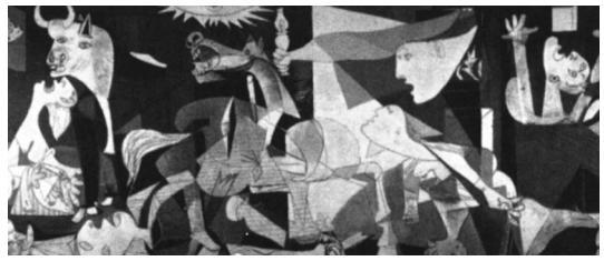
Picasso's Guernica in Madrid