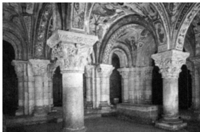
St. Isidoro's Royal Pantheon, in León (Front cover: León's Cathedral)