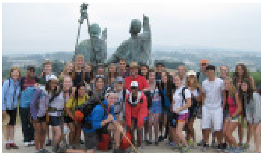
SIHS 2013, Santiago de Compostela