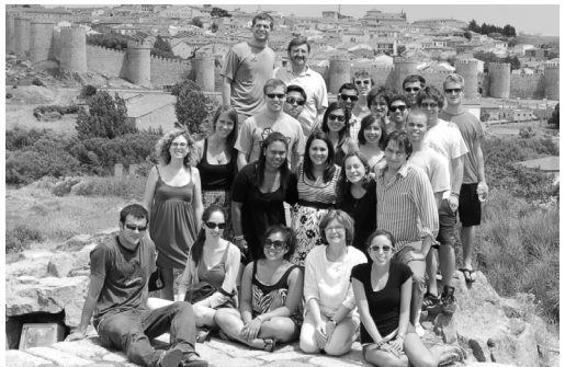
SIHS 2010, Avila and its Medieval Walls